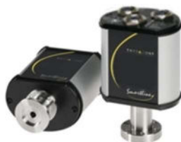
VSL5XE / VCL5XE

Version: 1.6 (only valid for VSL5XE, VCL5XE) Release: Juni 25, 2021 Copyright: © 2021 Thyracont Vacuum Instruments GmbH